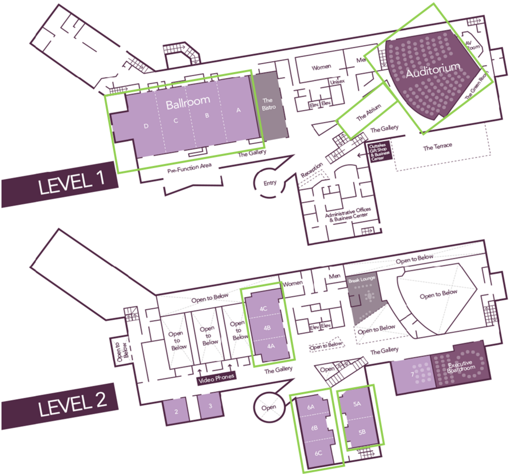
Kellogg Conference Center Map