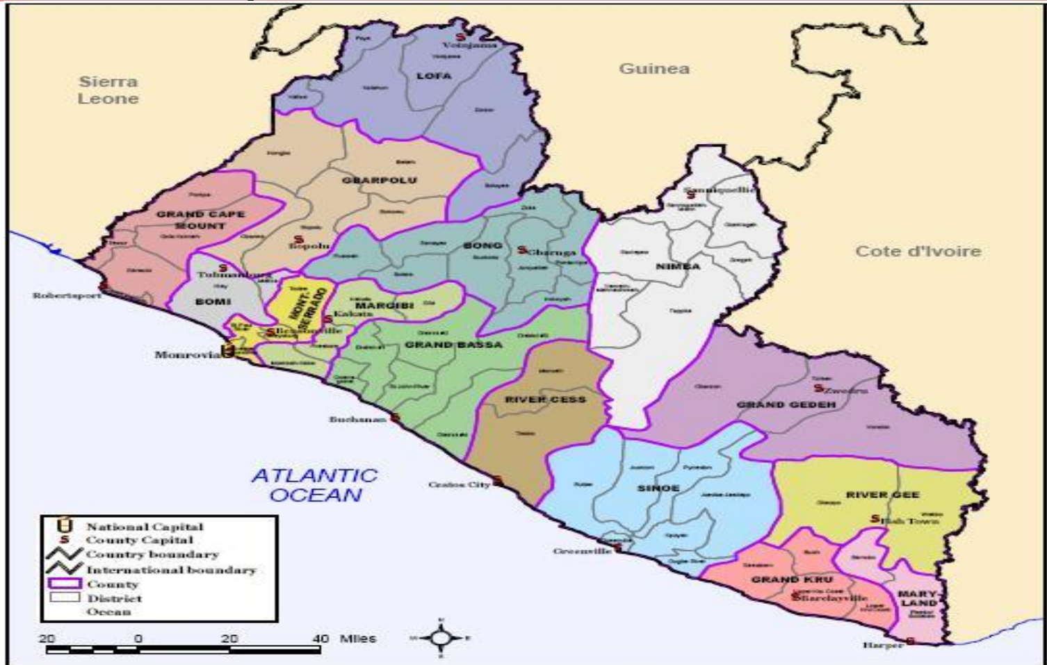
Map of Liberia and its fifteen counties.